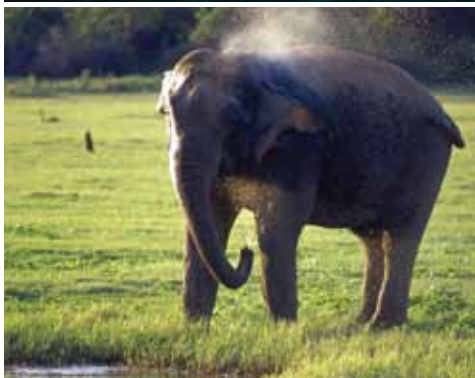
Top to Bottom: Worker at a cinnamon farm, Sri Lanka; Anjajavy Peninsula, Madagascar; Elephant, Minneriya National Park, Sri Lanka