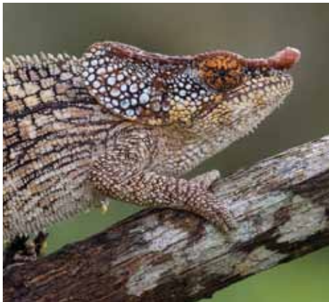
Elephant-eared Chameleon, Andasibe National Park, Madagascar

E nrichment is the key to rewarding exploration. A world-class team of experts will join the expedition, sharing their knowledge of and enthusiasm for the fascinating cultures, natural wonders, art, and architecture we encounter. They will use a special in-flight multimedia system for informative lectures on the jet, and join travelers in discussions during meals and special events on land. In addition, iPads® loaded with informative trip-related documents, e-books, movies, and documentaries are available to each traveler aboard the jet.