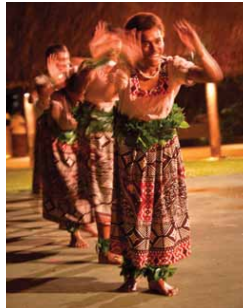
Top to Bottom: Elephant ride, Bali; The Maldives; Dancers, Fiji

Left-hand page, clockwise from top: Navala Village, Fiji; Green sea turtle, Maldives; Rice terrace, Bali; Colorful baskets in market, Ubud, Bali