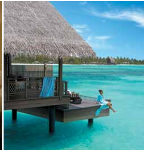
Shangri-La Villingili Resort & Spa, Maldives