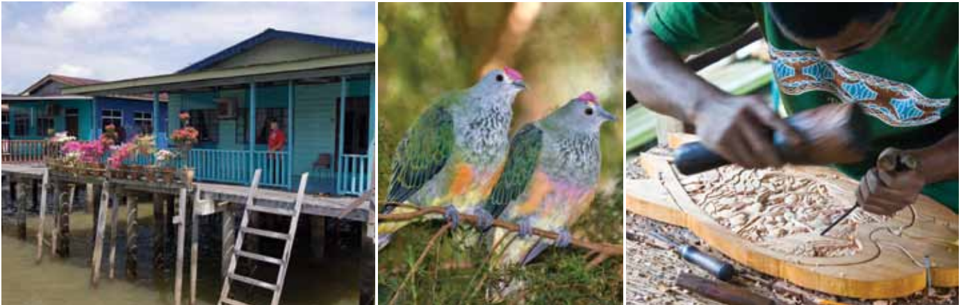
Left to right: Kampong Ayer Village, Brunei; Fruit dove, Palau; craftsman carving a traditional storyboard, Palau