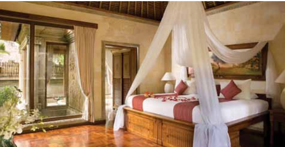
Royal Pita Maha, Bali