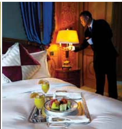
Cinnamon Lodge, Sri Lanka; The Empire Hotel & Country Club, Brunei