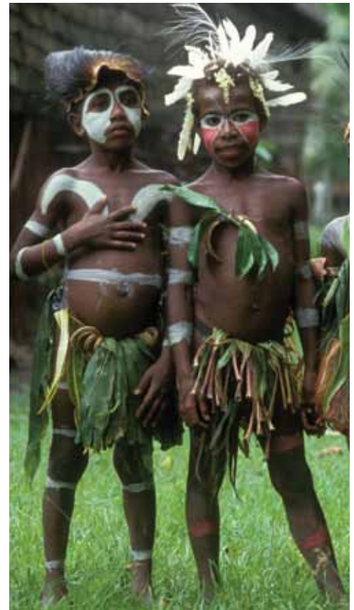
Top to Bottom: Fia fia, Samoa; Ambua Lodge, Southern Highlands, Papua New Guinea; Children of the Sepik region, Papua New Guinea