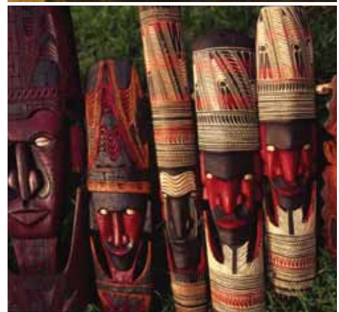
Top to Bottom: Legong dancers, Bali; Reclining Buddha, Polonnaruwa, Sri Lanka; carvings, Sepik River, Papua New Guinea