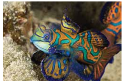
Top to Bottom: Riverboats, Brunei; Mandarin fish, Palau